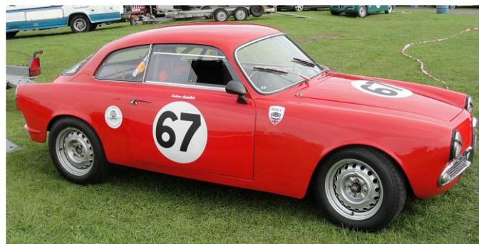
...while one of Alfa's best-known coupes is the racing Giulietta.