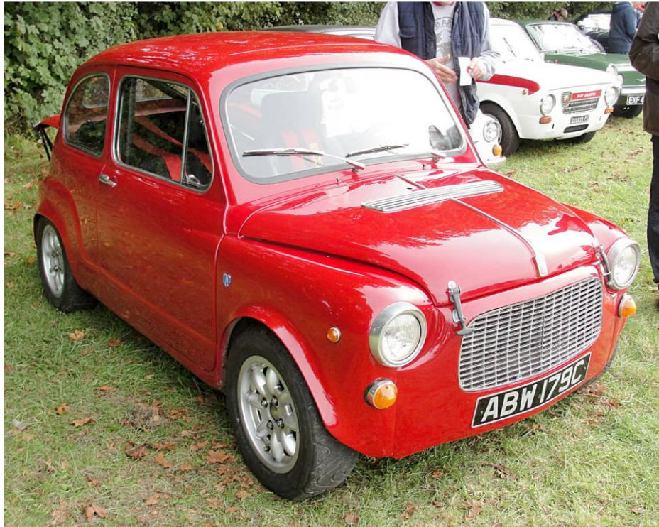
Even by Abarth standards this is a fast Fiat 600. It is a recreation -but using the original mechanical parts- of David Render's old 1960s hill climb car and has a 1.6 Lotus Twin-Cam in its rear!