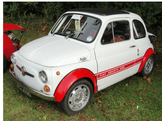
A fine pair of Fiat Abarths.