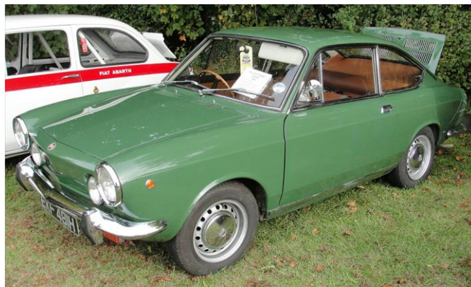
A rather more sedate rear-engined Fiat was this attractive 850 Coupe...