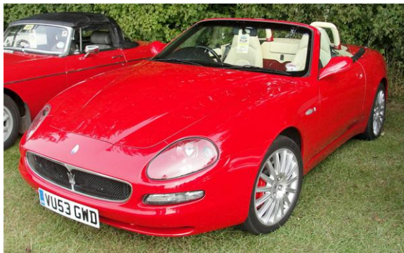
Maseratis old and newer.